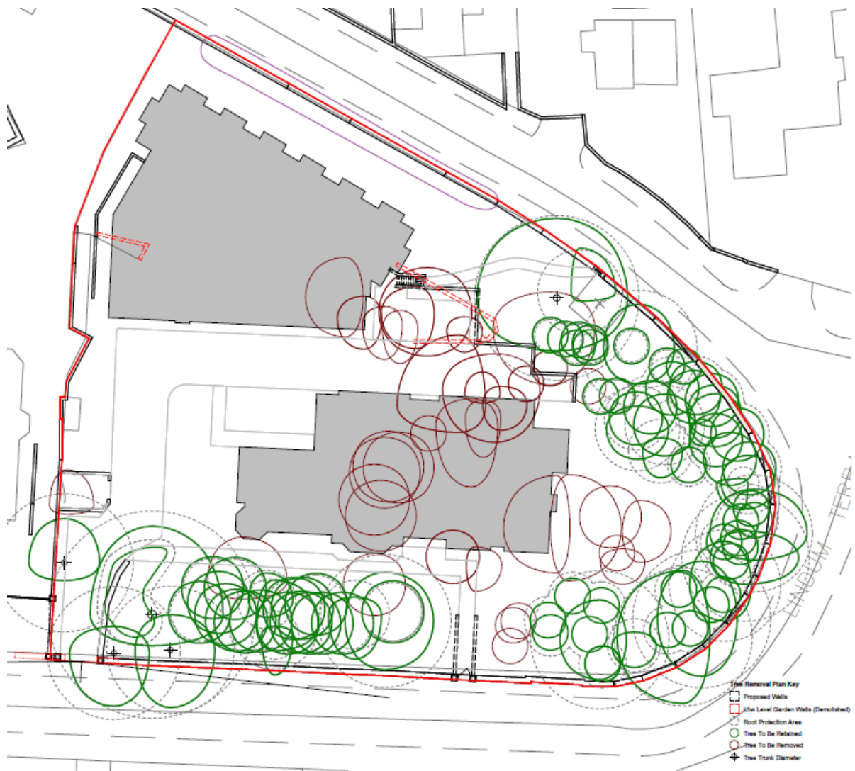
Tree removal plan