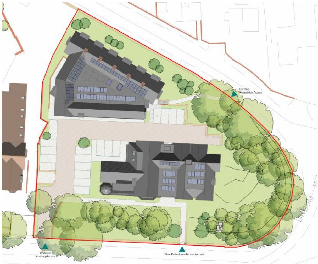
Proposed site plan