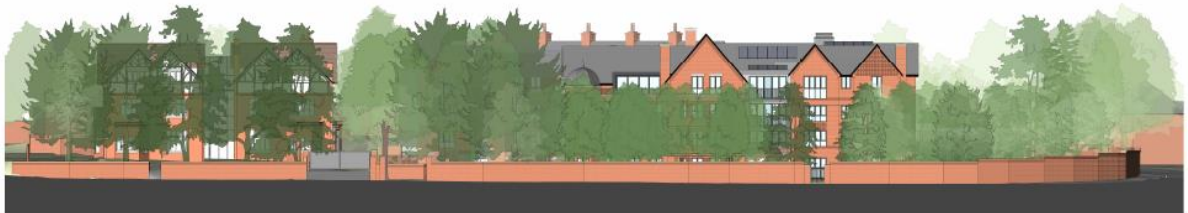
Proposed Lindum Terrace street elevation