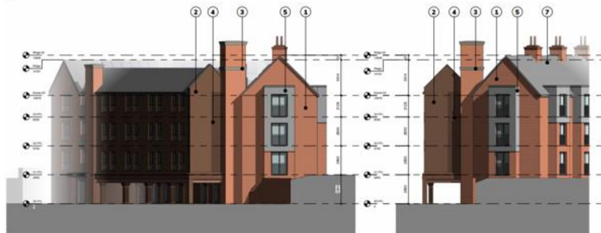
Building 2 elevations