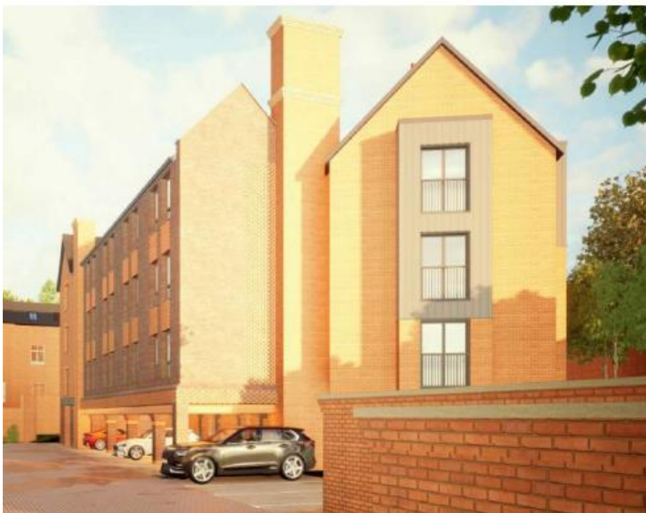
Visuals of Building 2