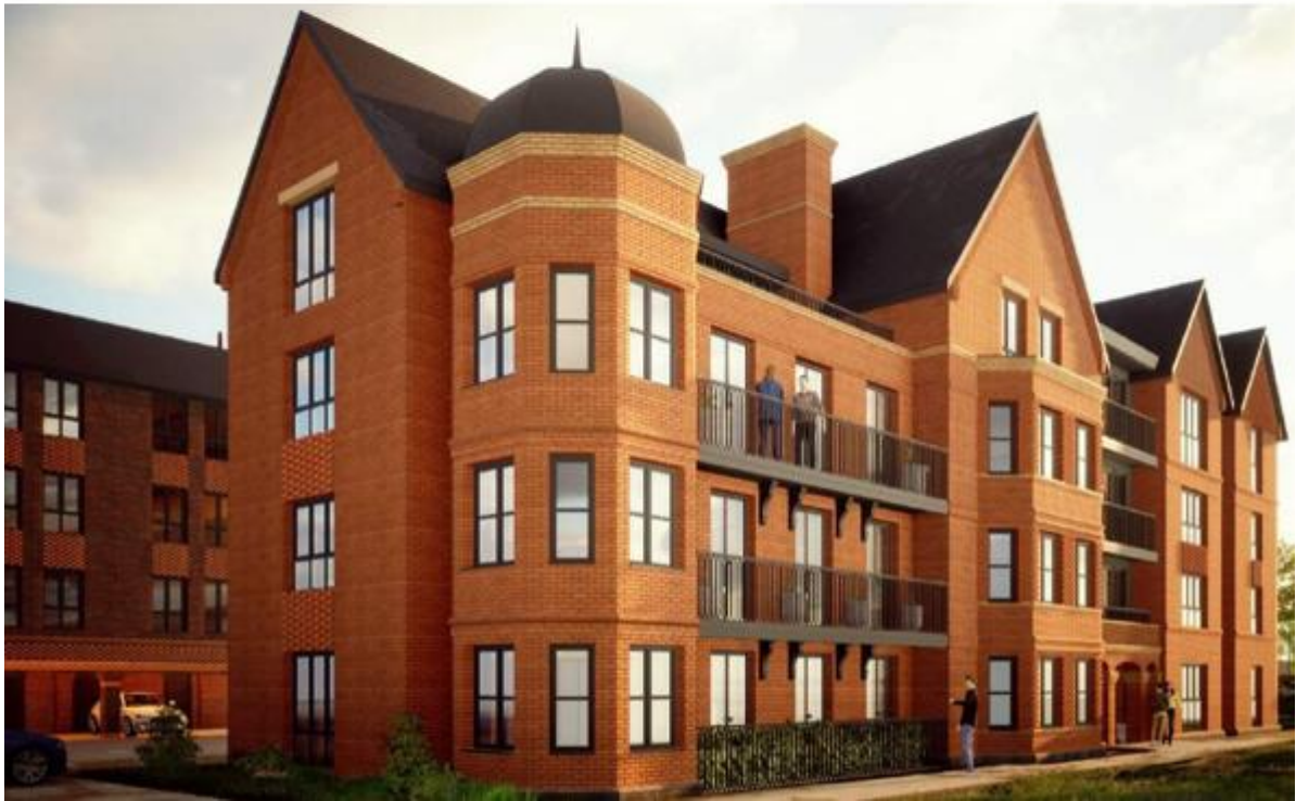
Visuals of Building 1