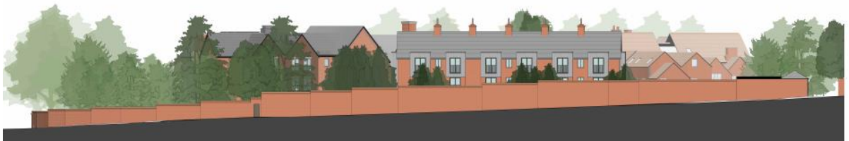
Proposed Sewell Road street elevation