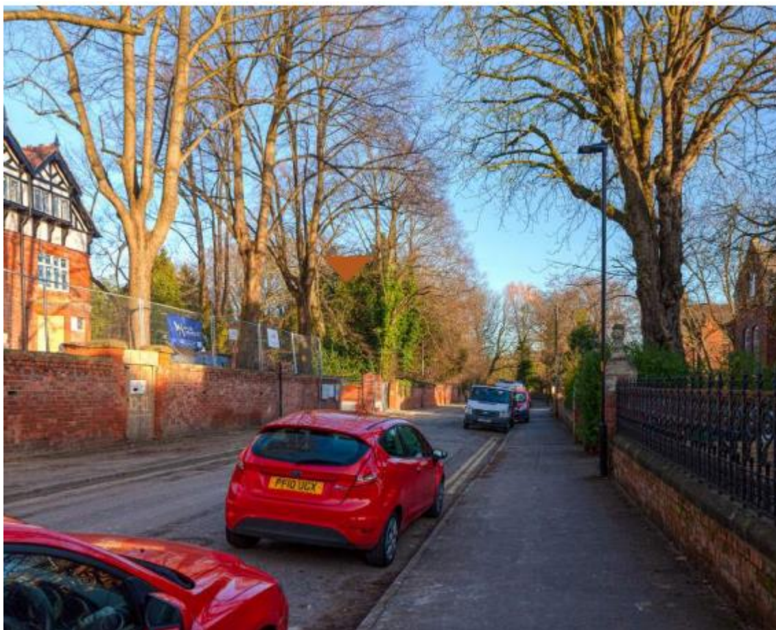
Photo of site from Lindum Terrace looking east