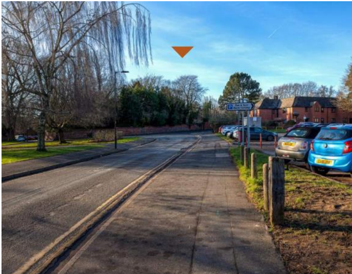
Photo of site from Sewell Road looking west