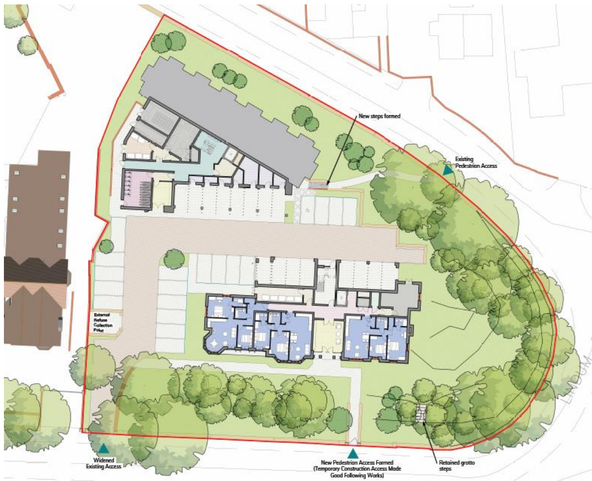
Proposed ground floor site plan