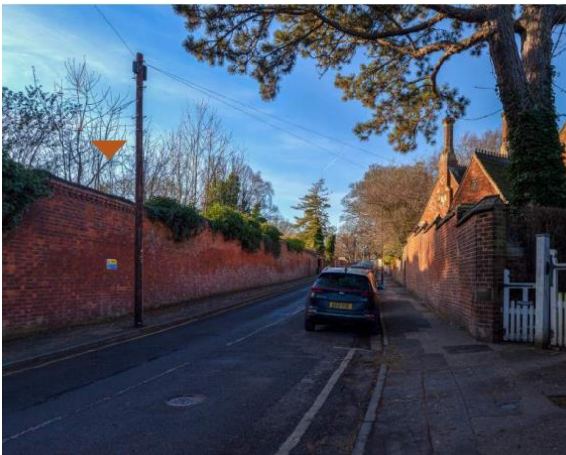
Photo of site from Sewell Road looking north west