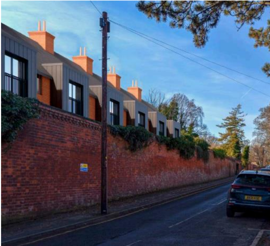
Visual of Building 2 from Sewell Road