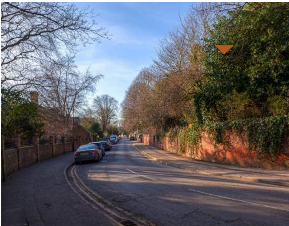
Photo of site from Lindum Terrace looking west