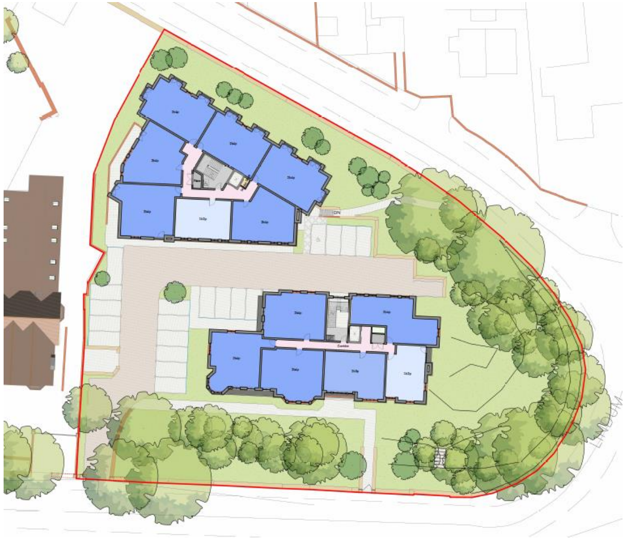
Proposed first floor site plan