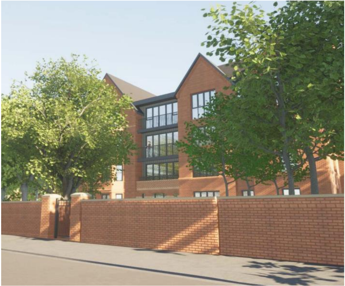
Visual of Building 1 from Lindum Terrace