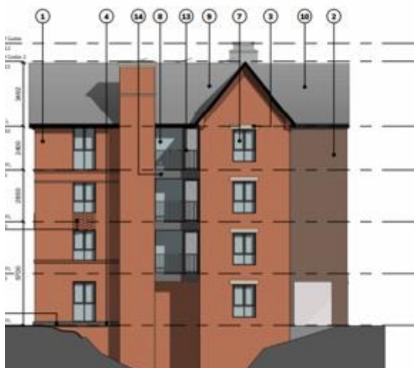
Building 1 elevations